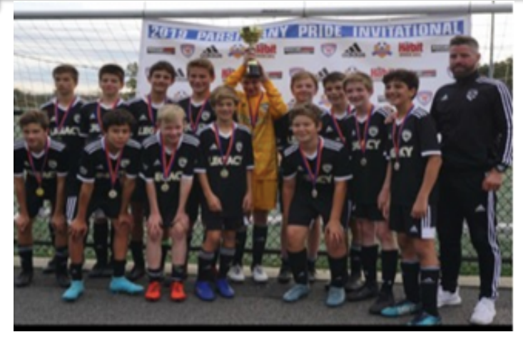
Legacy 06 Boys-Parsippany Pride Champions