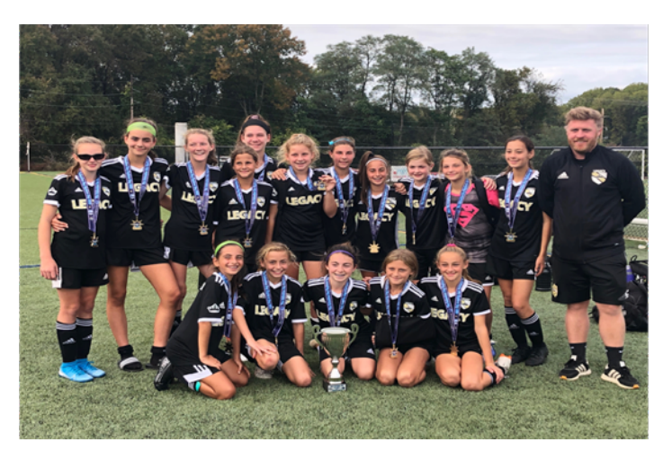
Legacy 07 Girls-APL Explorer Cup Champions