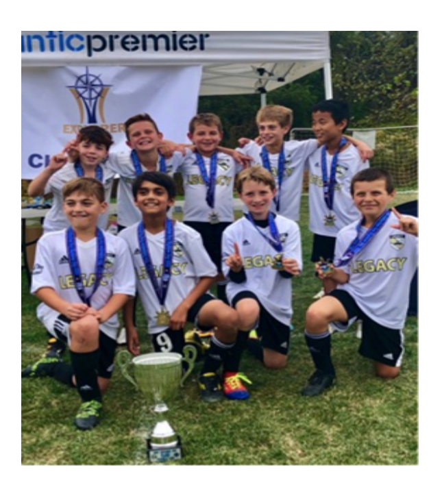
Legacy 09 Boys APL Explorer Cup Champions